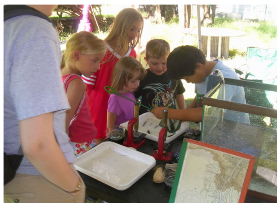
Young sailors explore life in the river, and educate the public at the environmental education tent.