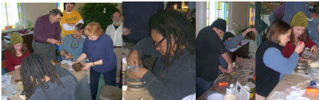
Woody Guthrie sailors and volunteers refurbishing the wooden blocks for the rigging at the Feb. 3 rd Block Party.